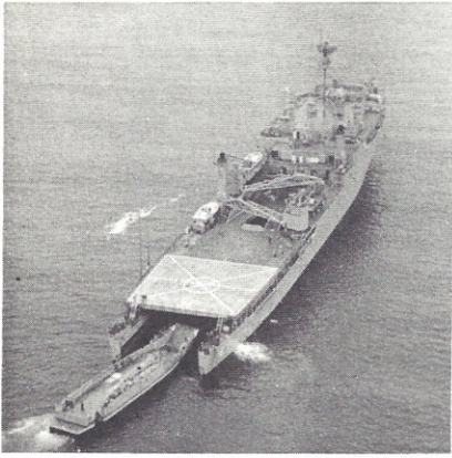
Landing of a Navy LCU Boat