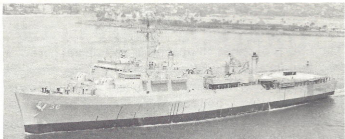
USS ANCHORAGE (LSD-36)

The USS ANCHORAGE (LSD-36) was launched at Pascagoula, Mississippi on 5 May 1968 and was officially commissioned on 15 March 1969 at Norfolk Naval Shipyard at Portsmouth, Virginia.