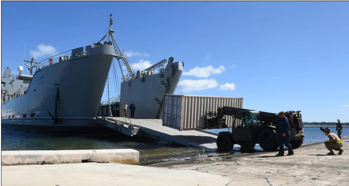
Figure 3. Besson-Class Logistics Support Vessel (LSV)

Source: Cropped version of photograph accompanying Walker D. Mills and Joseph Hanacek, “The US Navy and Marine Corps Should Acquire Army Watercraft,” Defense News , June 22, 2020. The caption to the photograph credits the photograph to the U.S. Navy and states, “U.S. Navy sailors conduct a simulated disaster relief supply offload from a General Frank S. Besson-class logistics support vessel at Joint Base Pearl Harbor-Hickam on July 10, 2016.”