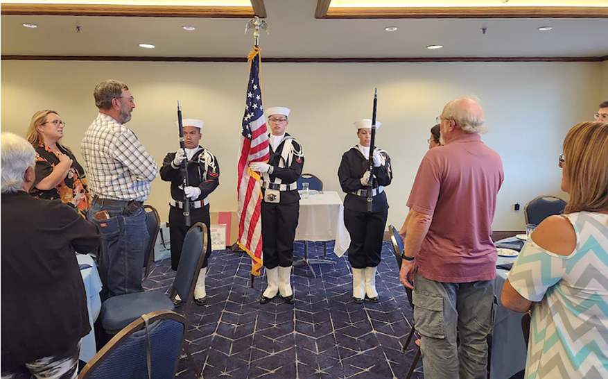
Naval Base San Diego Color Guard